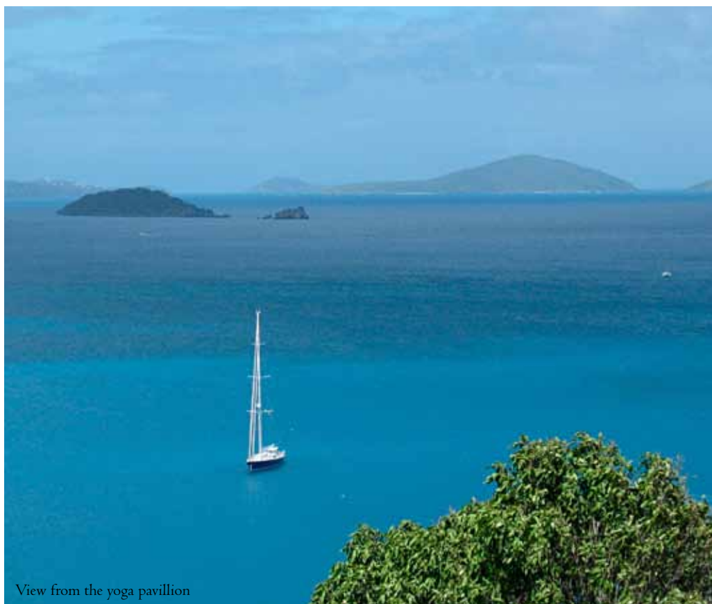
View from the yoga pavillion